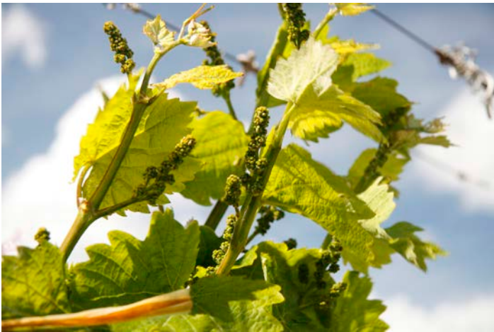
shortly before blossom season