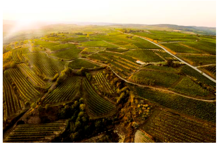
Vineyard Ried Steinhaus