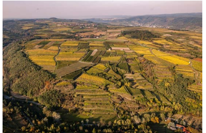
Vineyard Ried Seeberg