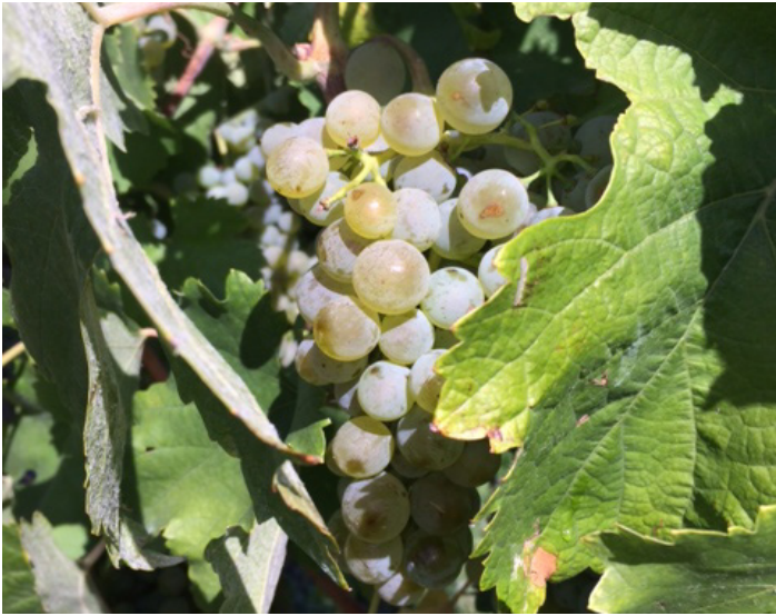
harvest Riesling grapes