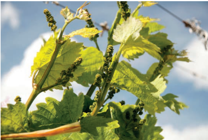
shortly before blossom season