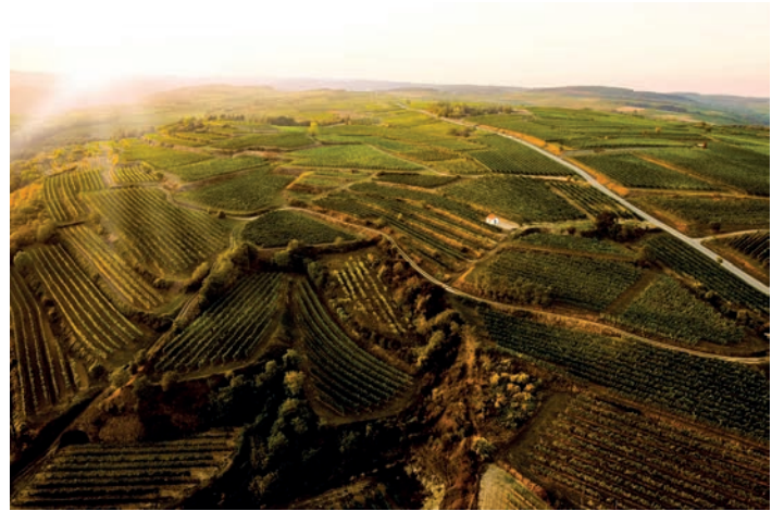
Vineyard Ried Steinhaus