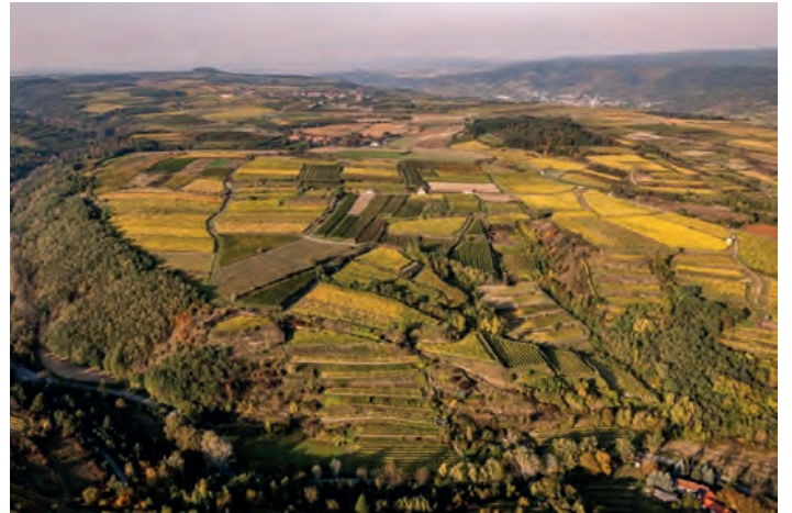
Vineyard Ried Seeberg