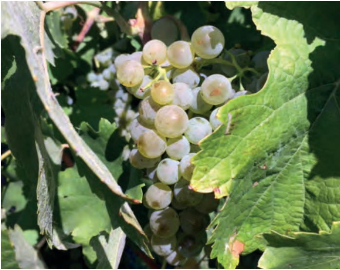
harvest Riesling grapes