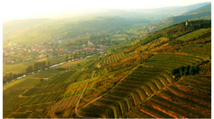
Vineyard Ried Heiligenstein