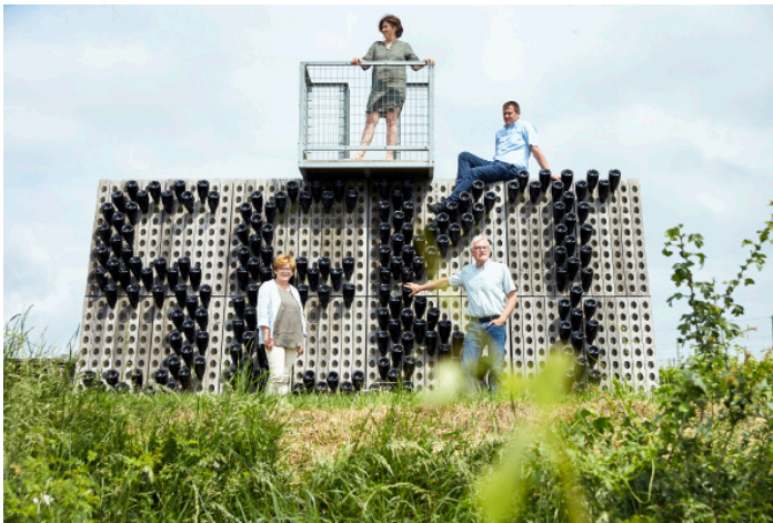
Family on the remuage rack