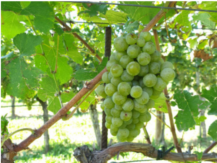
Grüner Veltliner grapes