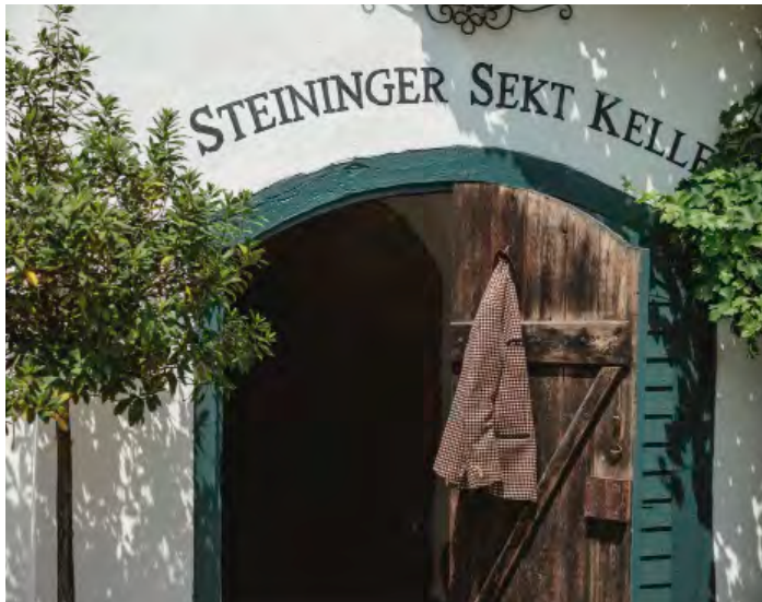
Sparkling cellar entry