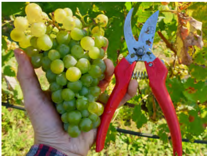
Grüner Veltliner grapes