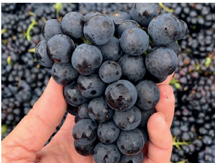
Cabernet Sauvignon grapes