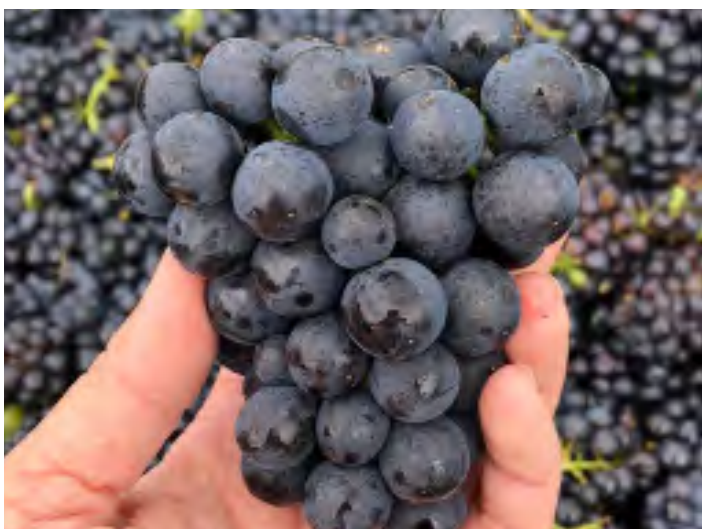
Cabernet Sauvignon grapes